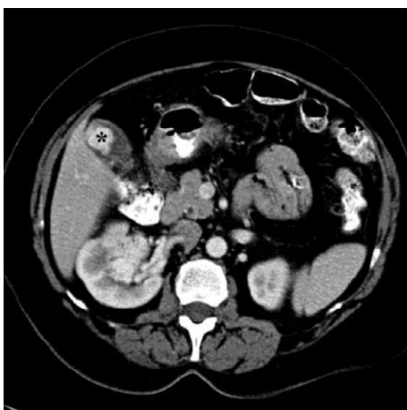
Figure 1. CT of primary RCC with gallbladder metastasis. There is a right renal tumor and associated mass in the gallbladder (black asterisk). Both lesions demonstrate similar hypervascular enhancement.

doi: 10.3834/uij.1939-4810.2008.11.04.f3